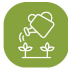
Little Green Thumbs