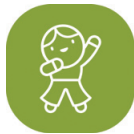
Dance & Drama